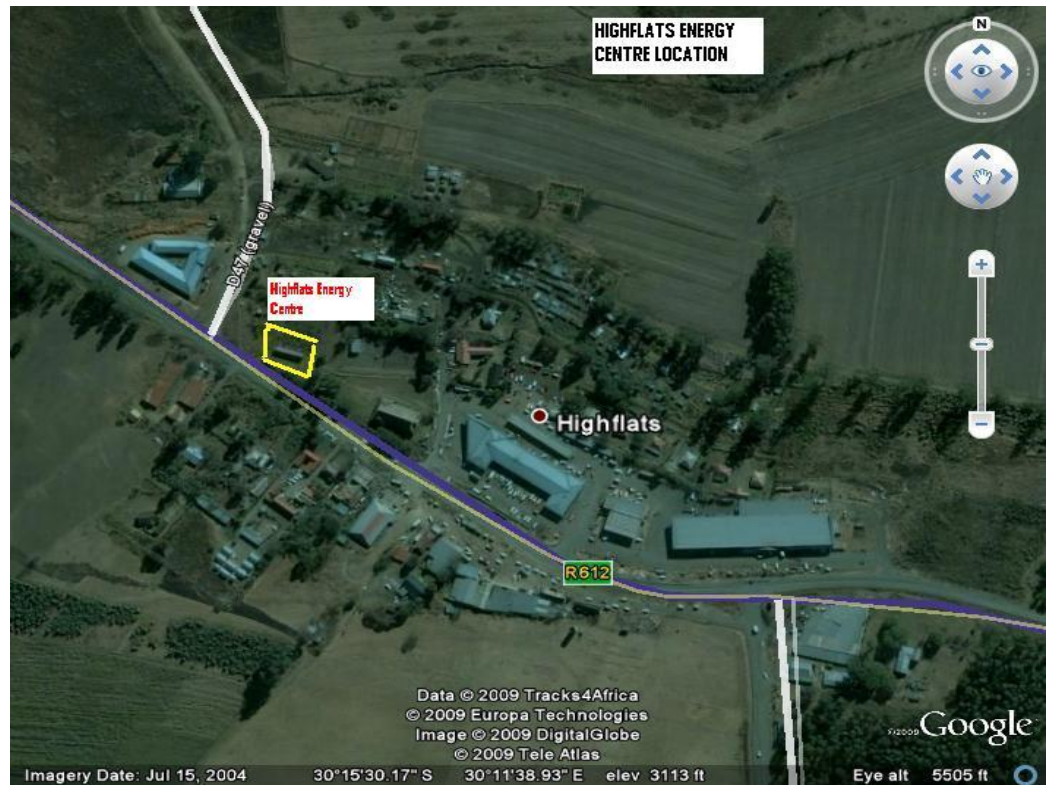
Highflats Energy Centre Location

services to the poor population. The overall goal of the project is to find sustainable solutions for the effective delivery of local energy resources to poor communities thereby assisting in alleviating poverty and contributing to sustainable development. Funding for the project was obtained from the Department of Science and Technology, funding for the renovation of the building was provided by Dutch Energy research Centre of the Netherlands (ECN) and the National Development Agency is providing funding for the operation of the centre. The Local Municipality plays an active role in the operation and promotion of the centre.